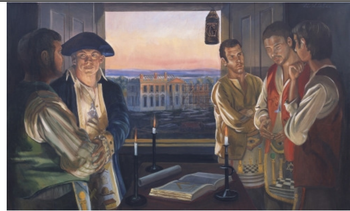
A Meeting at the End of the Day

"The first Stone of the President's House was laid on the 13th Day of October, 1792, and the 17th Year of Independence of the United States of America." The Charleston City Gazette, November 15, 1792 Stonemasons labored for almost 10 years to complete the design by Freemason James Hoban (c.1762-1831) who immigrated to America in 1785.